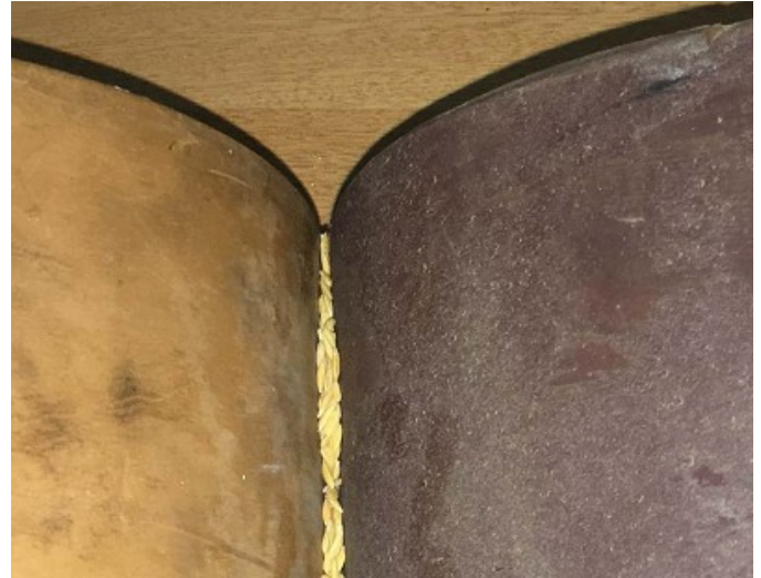
Fig. 2. Photograph of paddy in between rubber rollers before husk removal

The husking of paddy rice has characteristics of husking ratio, husking time and husking index. Photograph of paddy in between rubber rollers before husk removal is shown in the Fig. 2. The paddy dehusking rate increased from 60-90%, as the head brown rice yield (HBY) decrease. The highest HRY are obtained at the dehusking rate of 80% [34].