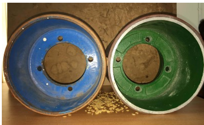
Fig. 1. Schematic of rice milling process

The rubber roll sheller is the most efficient hulling machine and have high hulling efficiency. The schematic diagram of rice milling process is shown in the Fig. 1. The rubber which is used in the shelling process should be prepared in consideration with the following requirements: Young's modulus 0.54 GPa, Poisson's ratio 0.45 and resistance to heat as the shelling machine can work for more than 24 hours without stopping. The two rubber rollers are having same diameter and operated at different speeds to remove the husk layer from the paddy. One roller