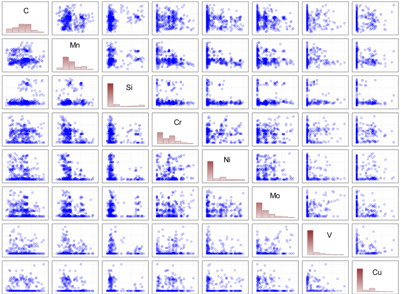
Fig. 1. Scatterplot matrix for the Ac_3 temperature model